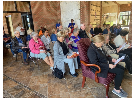
All Souls Day Prayer Service—2024

St. John Cemetery and Mausoleum/Chapel located on the corners of Richfield and Oak Roads, offers a wide range of choices: in ground earth burials/cremations, indoor and outdoor crypts for entombment, and indoor and outdoor niches for cremated remains. St. John Cemetery has been in existence since 1871 and provides a peaceful ambience in a safe and tranquil country setting.