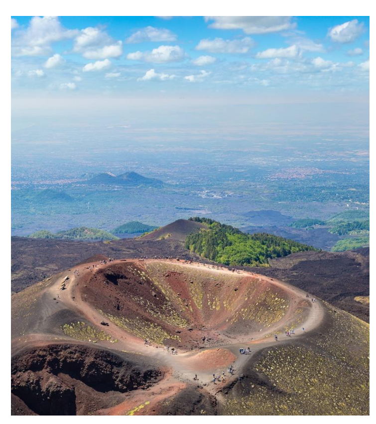
12 Days • 15 Meals: 10 Breakfasts, 1 Lunch, 4 Dinners

HIGHLIGHTS... Malta, Grand Harbour Cruise, Valletta, Ferry to Sicily, Aromatic Herb Farm Tour, Ragusa-Ibla, Siracusa, Taormina's Greek Theatre, Mount Etna Off-Road Excursion