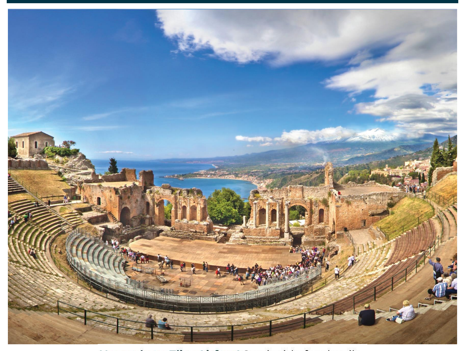
Upgrade to Elite Airfare! See inside for details.